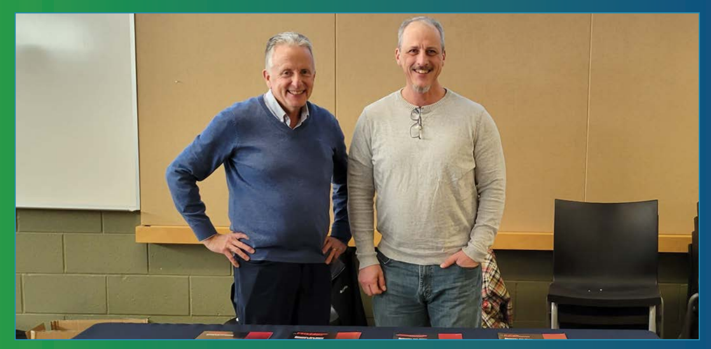
Thank You to Performance Engineering for sponsoring our meeting!